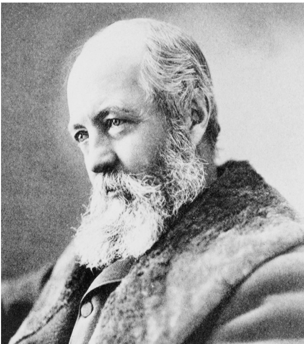
Fredrick Law Olmsted